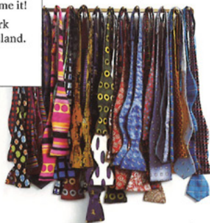
2. Bow ties, bow ties, and more bow ties.