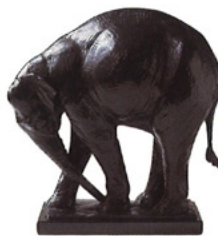
6. Dan Ostermiller's bronze elephant.