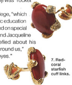
7. Red-coral starfish cuff links.