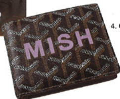
4. Goyard wallet.