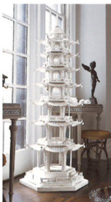
10. Painted-tin pagoda.