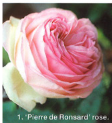
1. 'Pierre de Ronsard' rose.